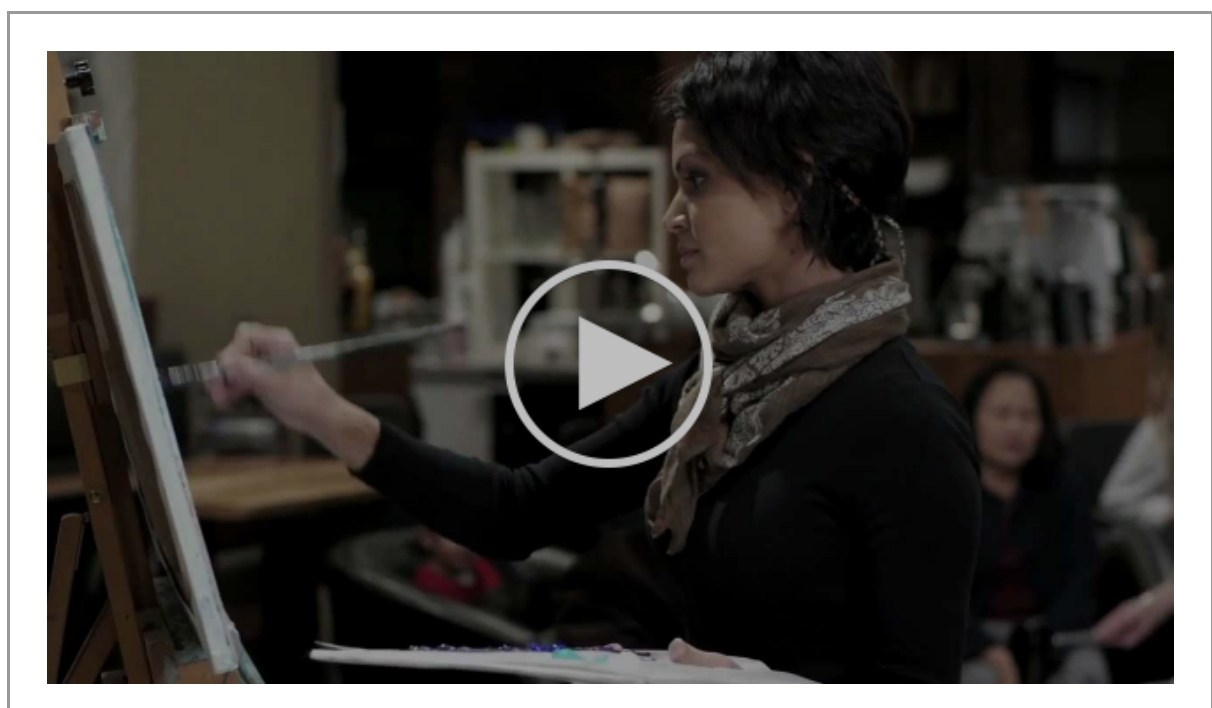
Kelowna, British Columbia: Richer with Colour

Have an event, workshop, or news item that you would like the community to know about? Email the details to the <u>LIP Coordinator</u> to be included in the next newsletter!